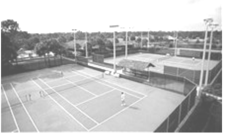
6 Lighted Tennis courts