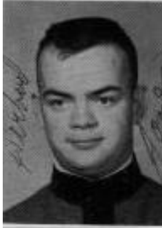
1959 post grad.

Memorial services were conducted on Monday, November 15, 2010 at the First United Methodist Church of Granite Falls.