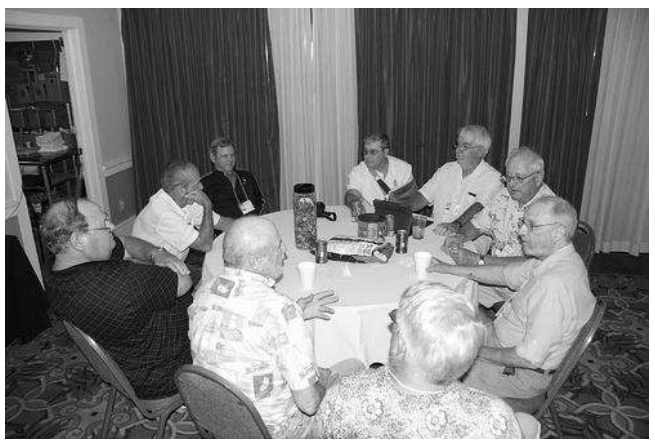
We tried to settled the world's affairs.

Rex's perpetual slide show of pictures kept our attention.